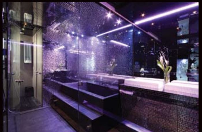
OWNER'S BATHROOM / STEAMROOM